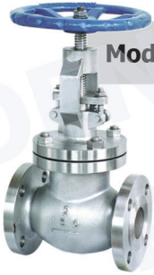
Model : GBC-150